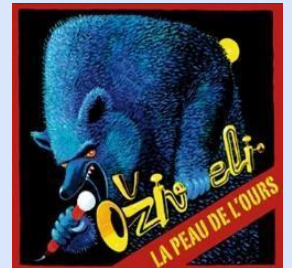
LA PEAU DE L'OURS (2010)